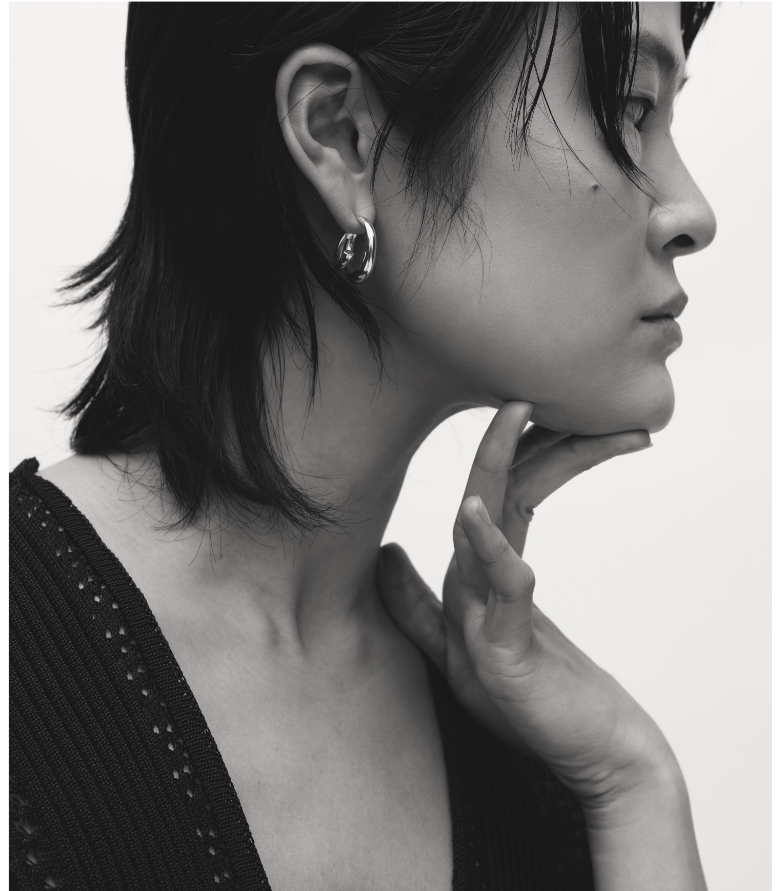
Strela Earrings - Sterling Silver