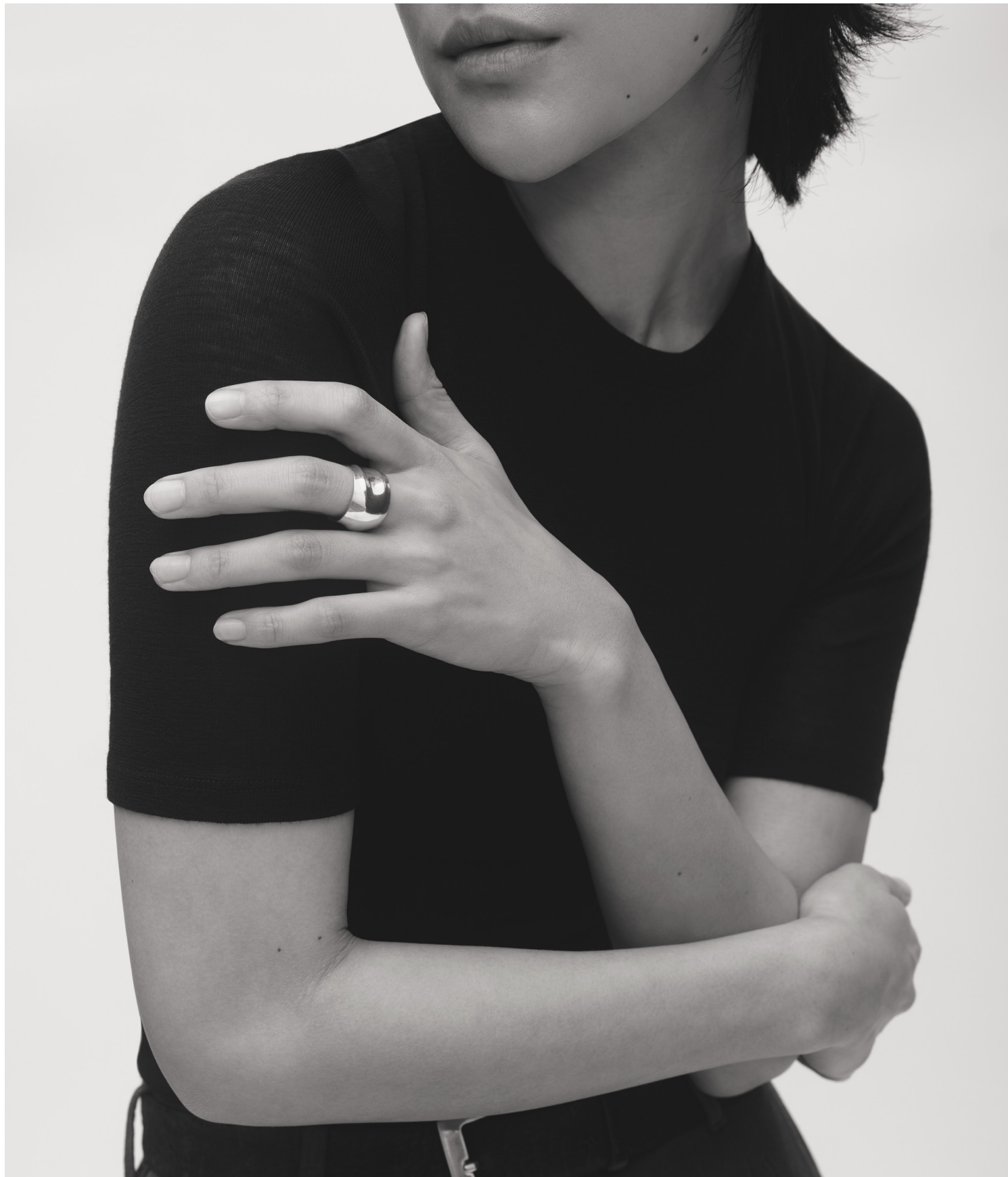
Block 27 Ring - Sterling Silver