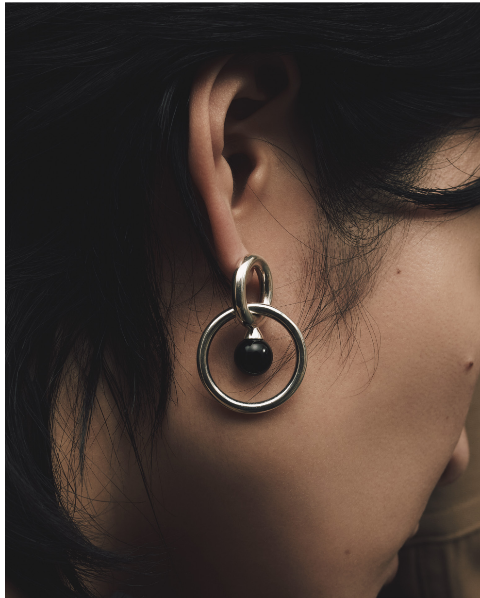
Double Hoop Earrings with Black Onyx - Sterling Silver

Block 27 Ring - Sterling Silver Medium Plain Hoops - Sterling Silver Half Stone Pendant with Tiger Eye - Sterling Silver