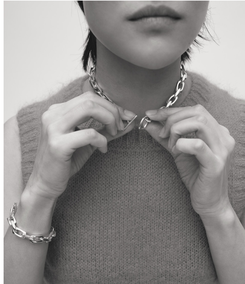
Square Link Chain - Sterling Silver