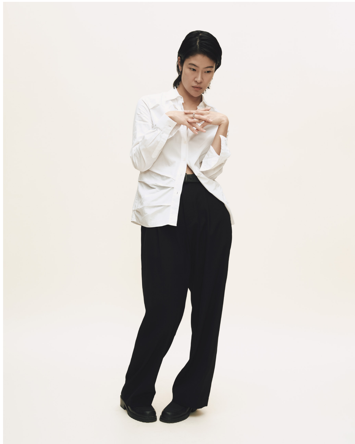
Block 24 Ring - Sterling Silver