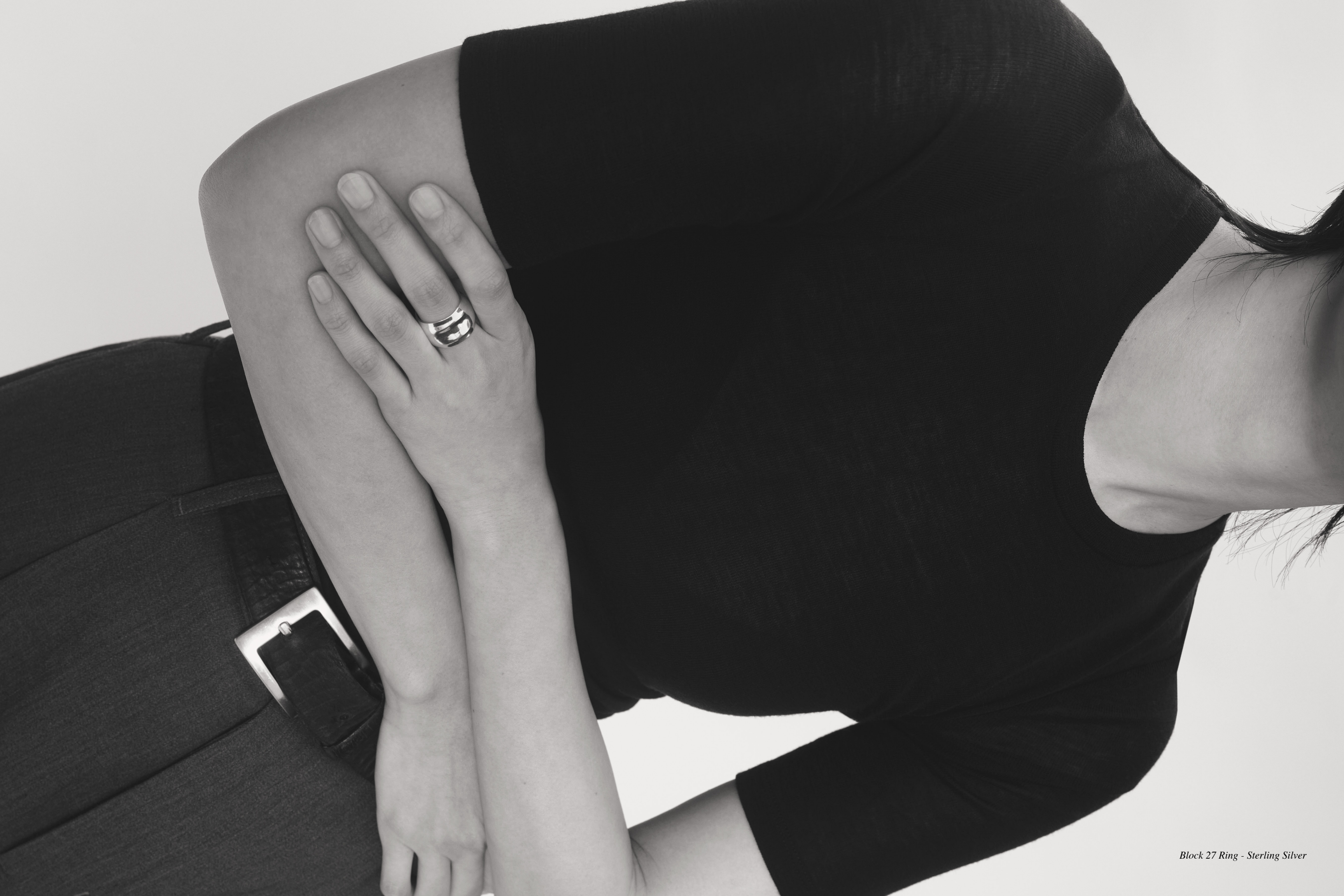
Block 27 Ring - Sterling Silver