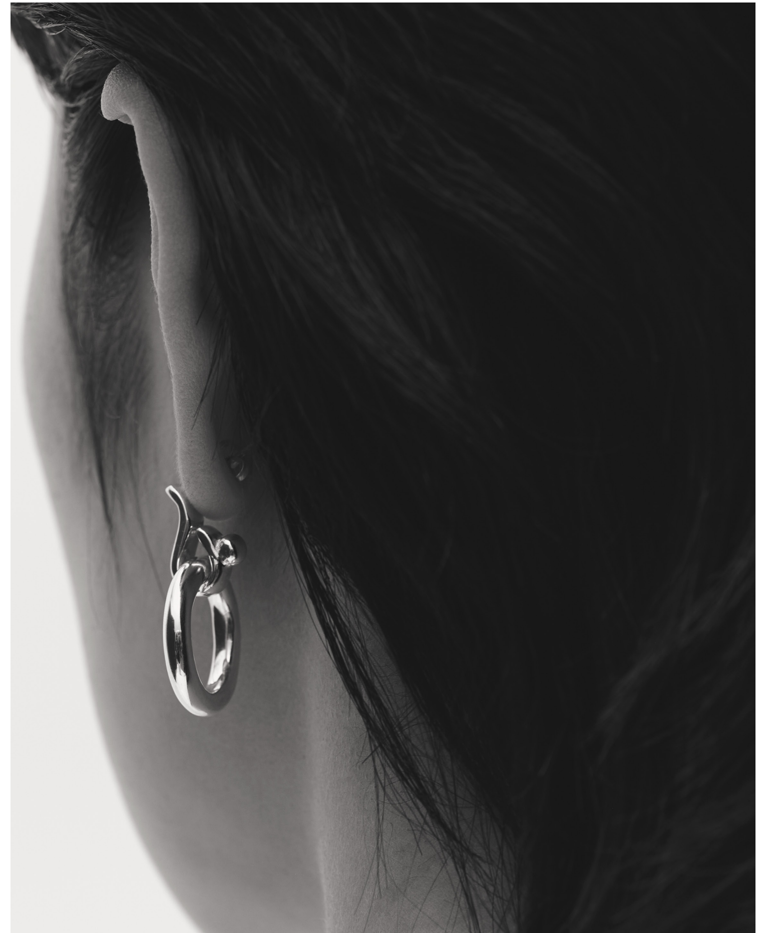
Hook Earrings - Sterling Silver