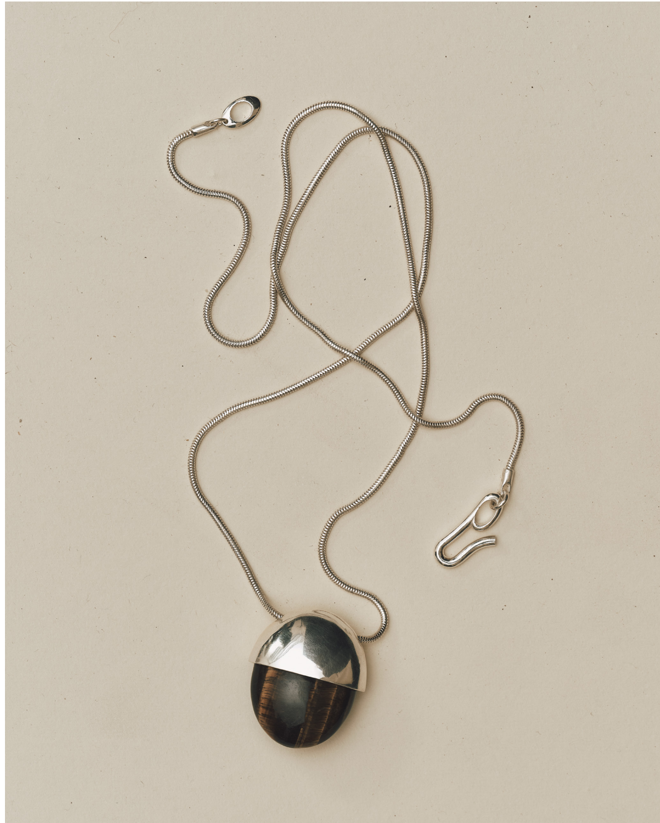
Half Stone Pendant with Tiger Eye - Sterling Silver