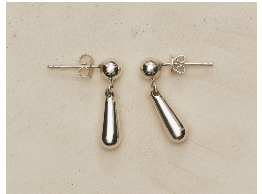
Blob Earrings - Sterling Silver