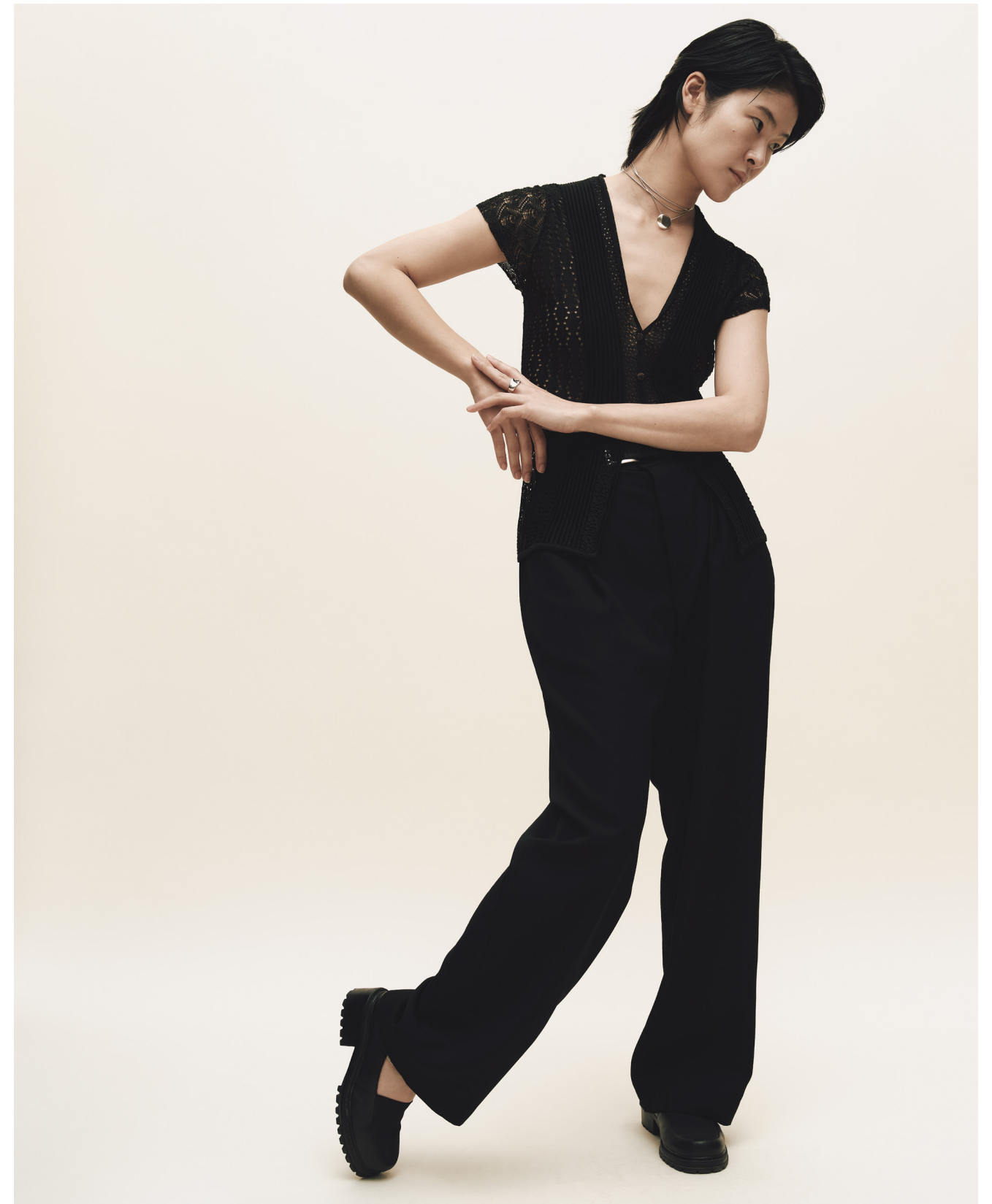
Oval Pendant on Snake Chain - Sterling Silver