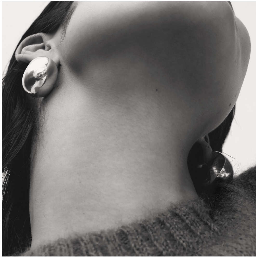
Dome Earrings - Sterling Silver