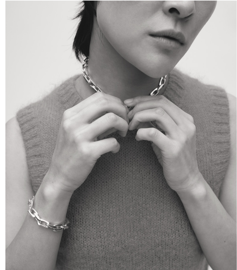
Square Link Bracelet - Sterling Silver