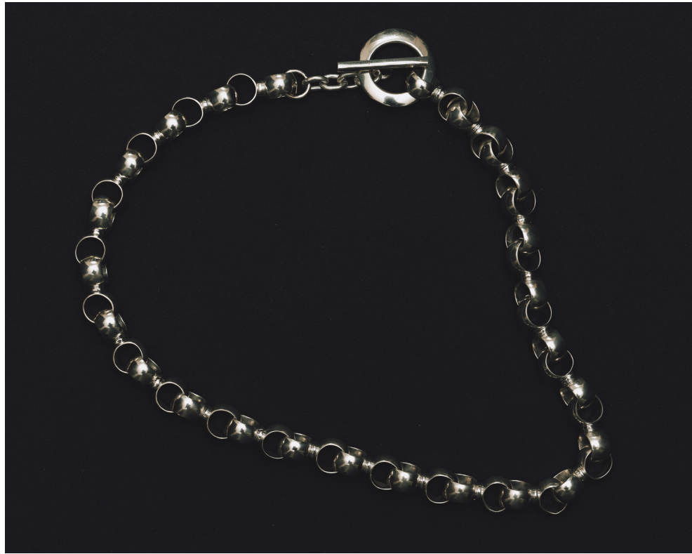
Round Link Chain - Sterling Silver