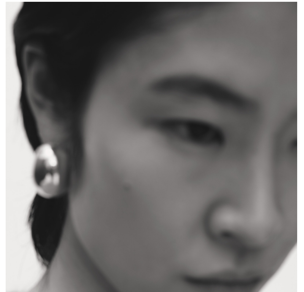
Dome Earrings - Sterling Silver