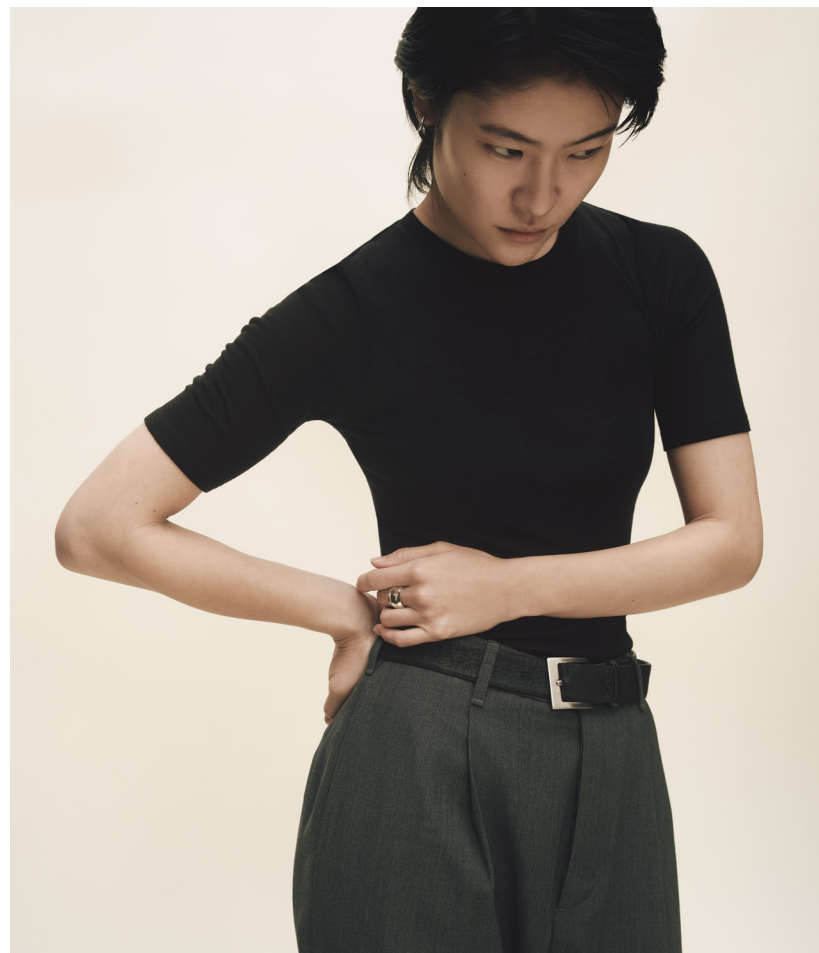
Block 27 Ring - Sterling Silver