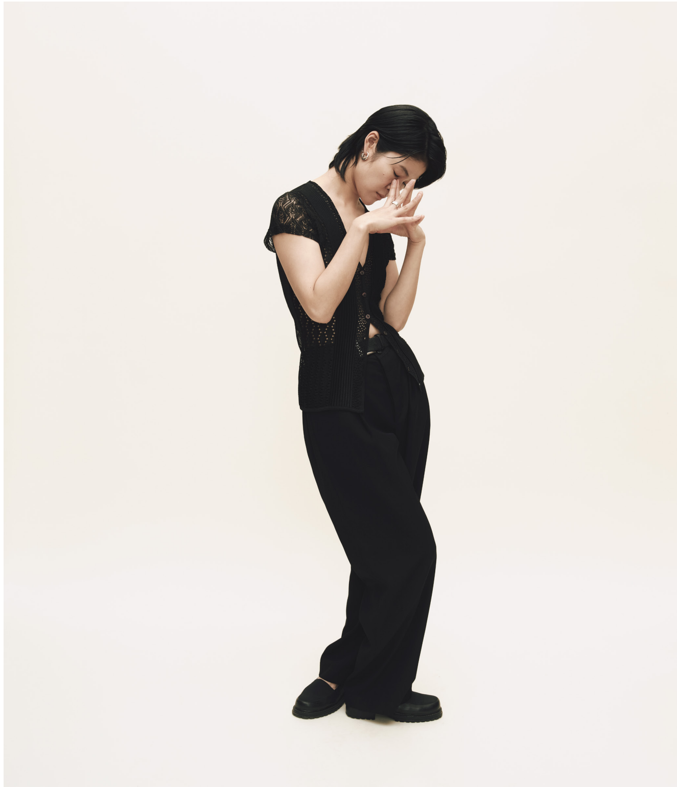
Strela Earrings - Sterling Silver