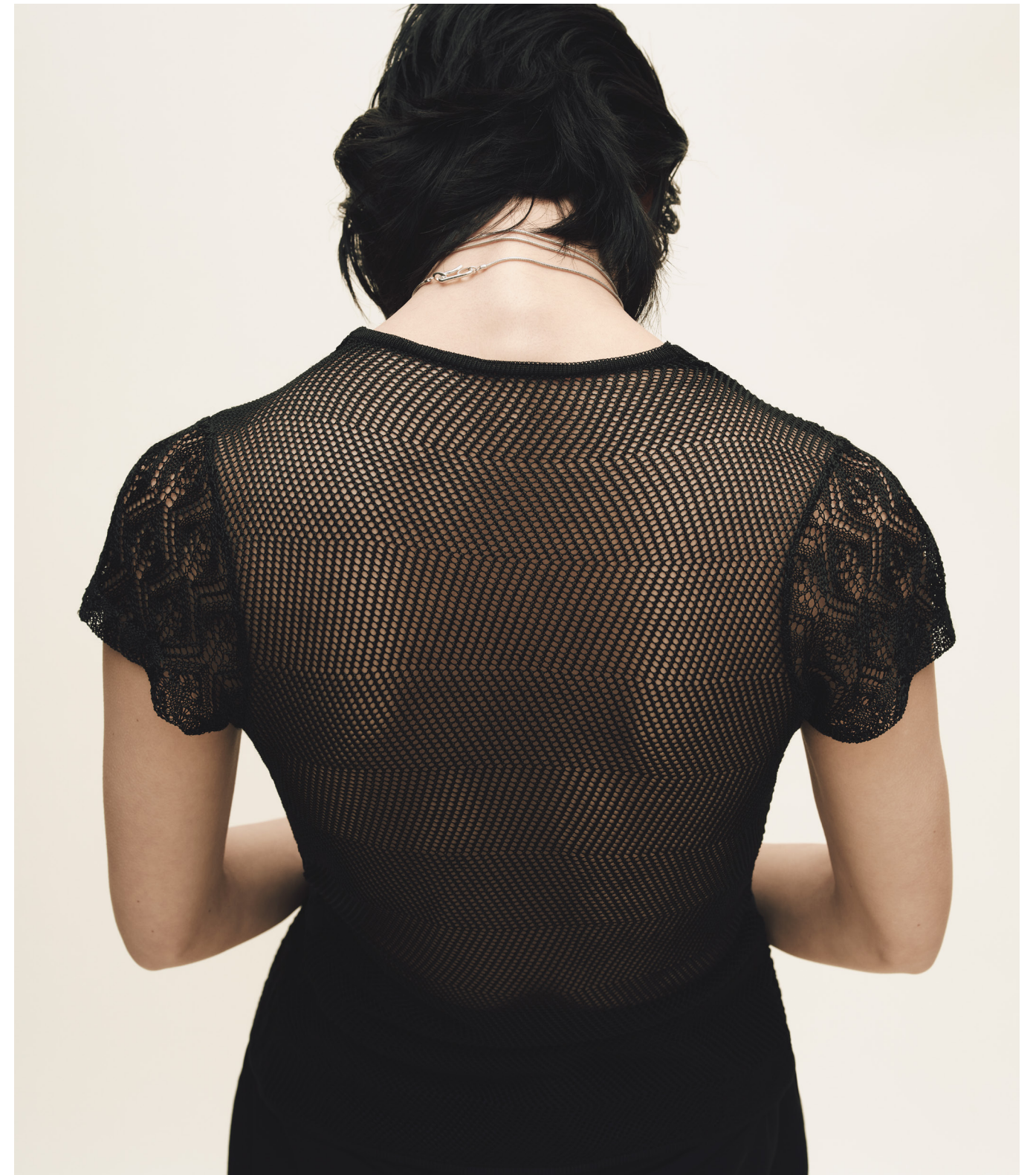
Oval Pendant on Snake Chain - Sterling Silver