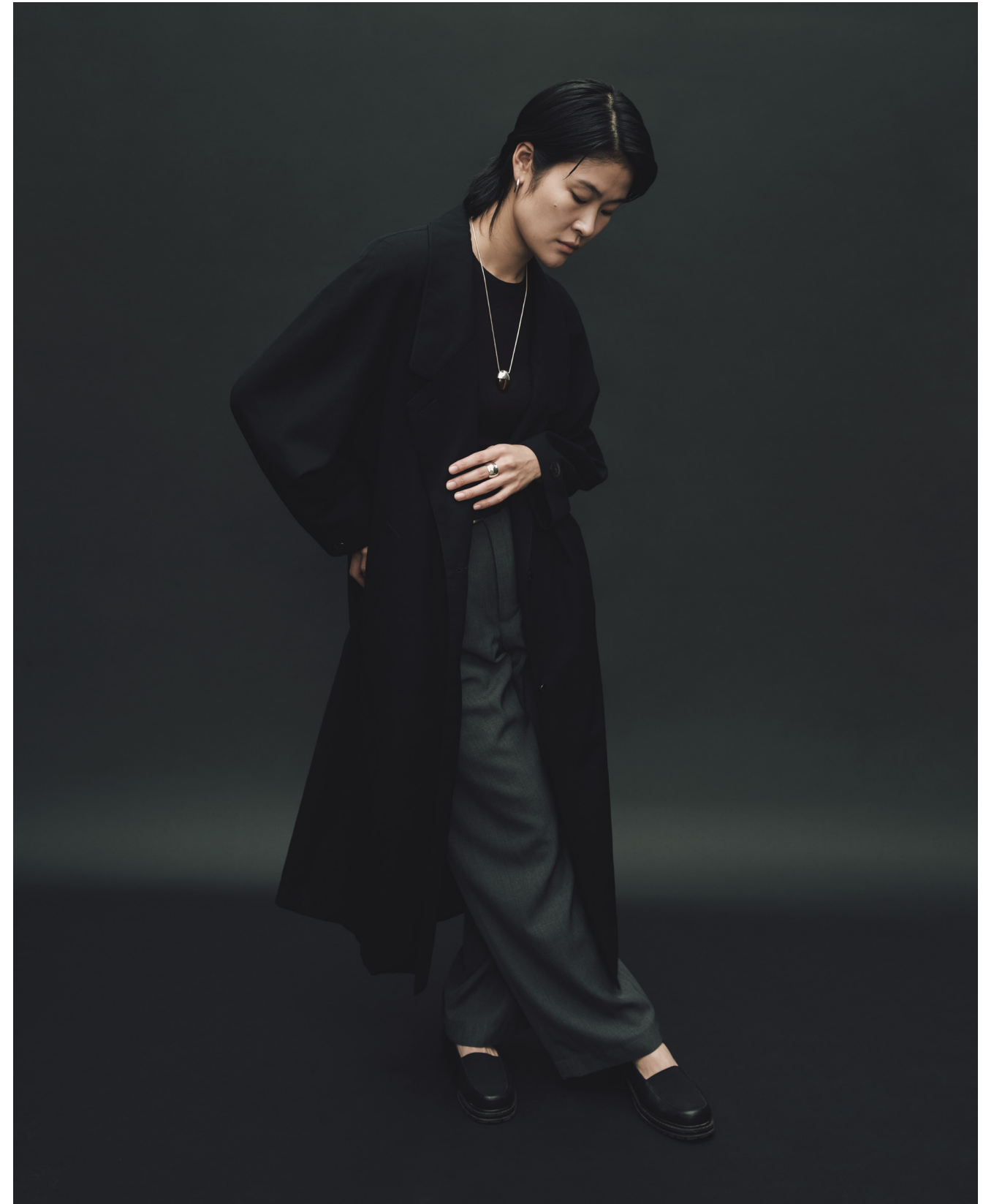
Half Stone Pendant with Tiger Eye - Sterling Silver