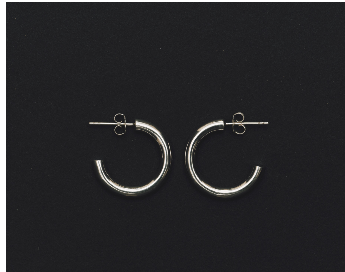
Medium Plain Hoops - Sterling Silver