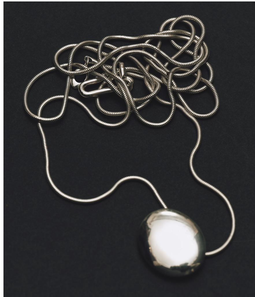
Oval Pendant on Snake Chain - Sterling Silver